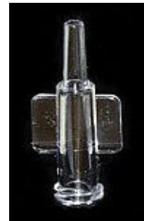
Bottom Fill Adapter

The Inksupply.com Empty Spongeless Cartridges for the Epson are a truly spongeless cartridge. These cartridges are designed to allow air to enter from the vent hole on the top of the cartridge and flow through a set of channels to the ink chamber at the very bottom of the cart. This prevents the print head from seeing any pressure thus eliminating siphoning issues.