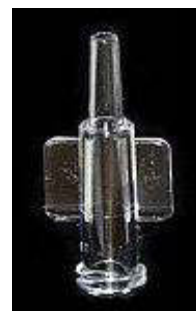
Bottom Fill Adapter